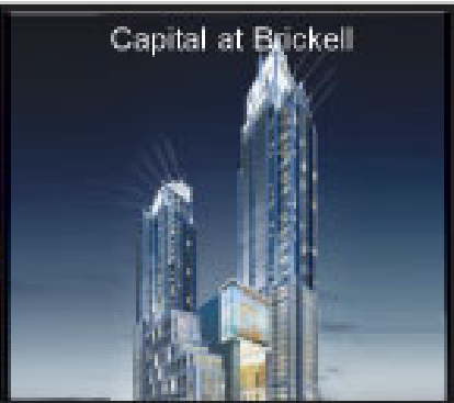
Capital at Brickell