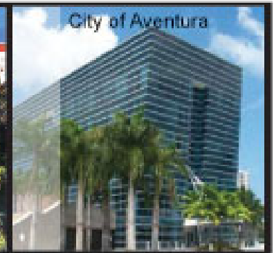
City of Aventura

Serving Aventura, Bal Harbour, Bay Harbor, Golden Beach, Hallandale Beach, Hollywood, Sunny Isles Beach, Surfside www.communitynewspapers.com March 11 - 17, 2009